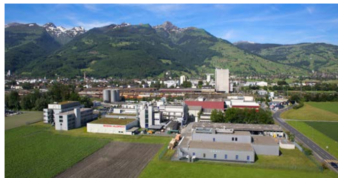
The Sigma-Aldrich facility in Buchs, Switzerland.

In recent years Sigma-Aldrich, in partnership with Zurich University of Applied Sciences (ZHAW), has gained a great deal of experience developing an excellent range of Certified Reference Microorganisms (CRM) called Vitroids™. The process was standardized and CRM quality improved to a level superior to today's standard. Since 2008, knowledge has been acquired to extend production according to ISO guide 34 and certification according to ISO/IEC 17025 to the field of microbiology. With two manufacturing and development sites, one in Laramie, Wyoming U.S.A. and the new one in Buchs, Switzerland, fulfills this growing demand for microbial CRMs. Combining the know-how and capabilities of Sigma-Aldrich and PHE will benefit microbiologists all over the world.