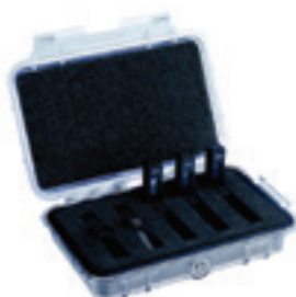
Set of Glass Filters (Z600040)

Hellma® Analytix calibration standards for UV/VIS spectroscopy meet internationally recognized standards and provide for highest process transparency. They ensure dependable examination of the spectral resolution, the wavelength accuracy, as well as checking for stray light and photometric accuracy. The standards are produced in a DIN EN ISO 17025 accredited calibration laboratory, are traceable to NIST and are in accordance with the most important Pharmacopoeias.