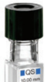
Septum Screw Cap