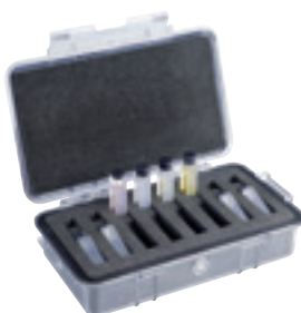
Set of Liquid Filters (Z802204)