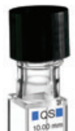
Solid Top Screw Cap