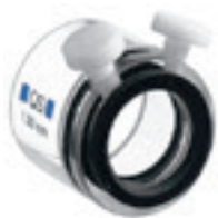
Cylindrical Absorption Cuvette (Z804657)