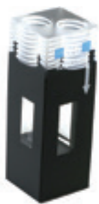
All-Quartz Flow-Through Cell (Z802239)