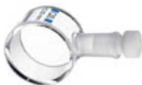
Cylindrical Absorption Cuvette (Z803308)